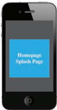
Home Page Splash Page

Ad opportunities: Home page splash page, in-line run-of-site.