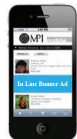
In-Line Run-of-Site Ad