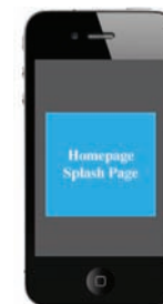
Home Page Splash Ad