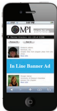
In-Line Run-of-Site Ad