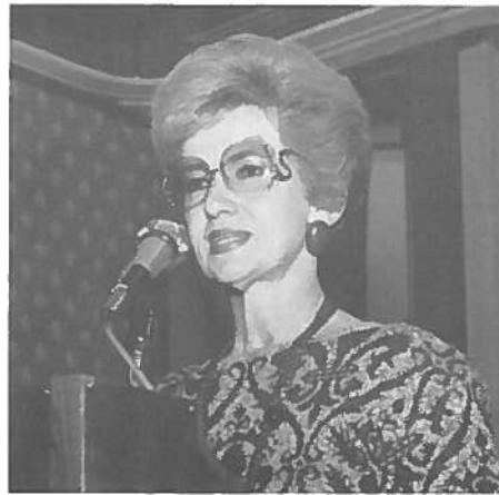
Marilyn Monroe CAE