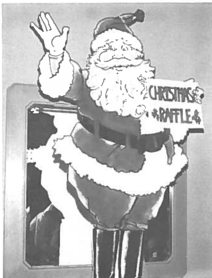
Yes, Santa was there, were you???