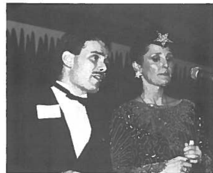
Our Master of Ceremonies at the Christmas Dinner...

One very special word of thanks to Incredible Production for their three time standing ovation production.