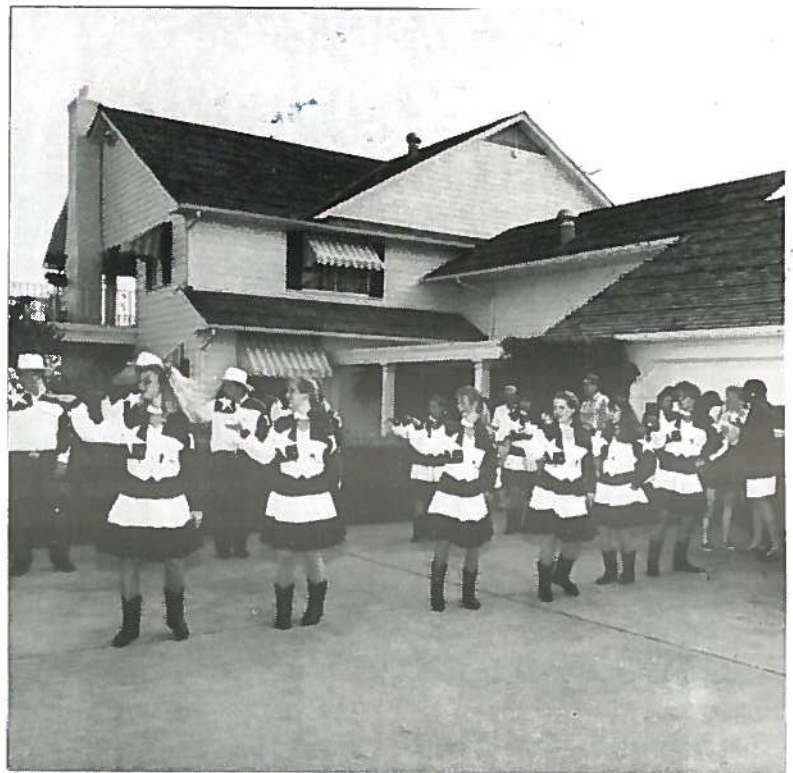
ABOVE: The Wildcat Wranglers dance team.