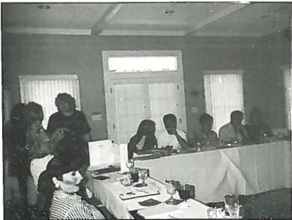
LEFT: Chapter leaders enjoy spacious meeting planning facilities during a summer planning retreat.