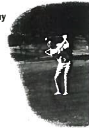
Inverness Golf Club The Scanticon Denver