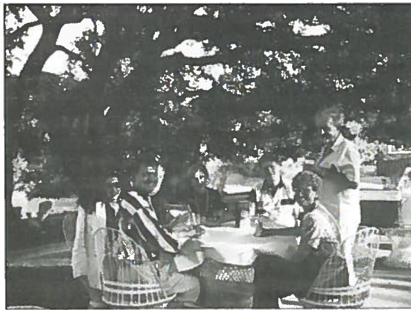
RIGHT: Officers and directors pause for a refreshment break at Inn on the River.

As we move through the projects outlined for the coming year, remember: TEAM MPI. Through the teamwork of all "Supplanners," Together Everyone Achieves More.