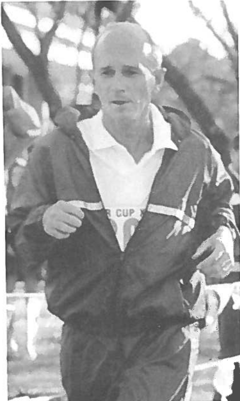
Kenneth Cooper, M.D.

Guest speaker is Dr. Kenneth Cooper, known internationally as "the man who started America running." More than any other person, Cooper, founder of the Cooper Aerobics Center, has motivated more people