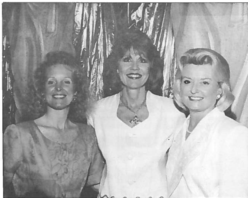
Presidential Triumvirate—Past, Future and Current