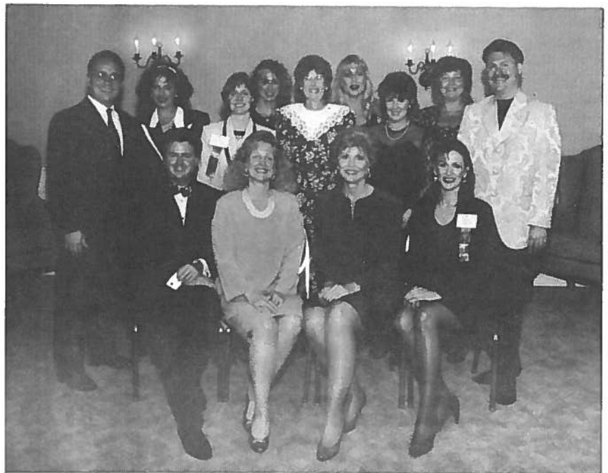
BELOW: Thirteen of the 25 1994-95 officers and directors gather for a group portrait prior to the May Awards Gala at the Grand Kempinski.