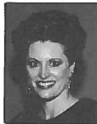
Kathi Thompson Inn on the River