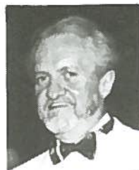
O.D. O'Donnell Nightlife Talent & Mgt. Agency