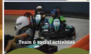
Team & social activities

Conveniently located directly off I-94, between Milwaukee and Madison, we offer complimentary personalized services to help make your meeting a success. Additionally, our area offers: