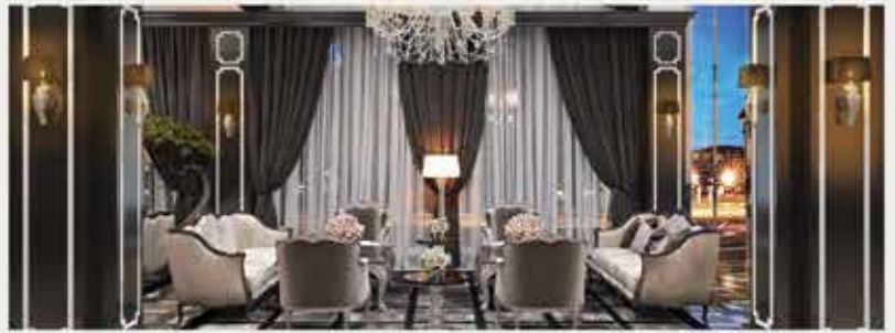
Hotel Retlaw Lobby | thehotelretlaw.com

Dedicated to meeting excellence and exceeding expectations.