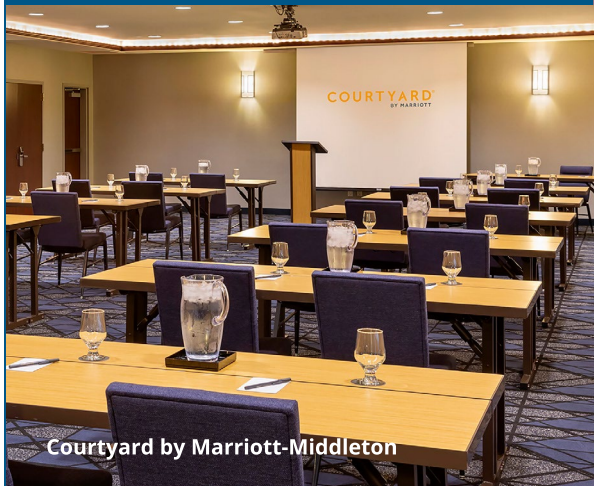
Courtyard by Marriott-Middleton