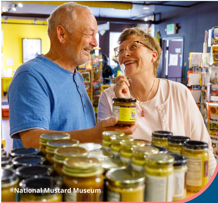
National Mustard Museum