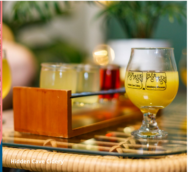
Hidden Cave Cidery