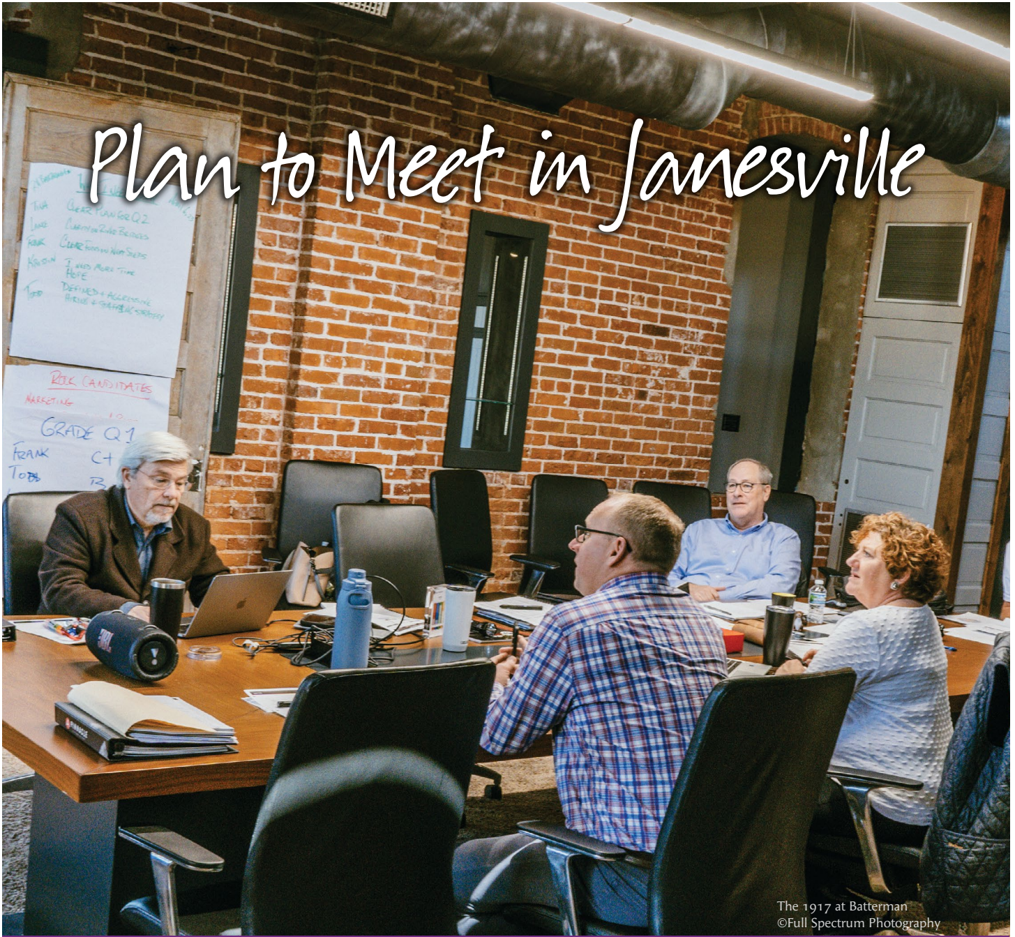
The 1917 at Batterman